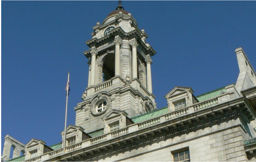
The majority of documents prepared by land surveyors will pass through the front doors of town hall.

and Realtor creates a nice flow of additional work. Schmuckal uses additional services often, “As a Zoning Administrator, I also greatly value the shore land and floodplain delineations performed by surveyors.” Remember that the majority of documents created by professional land surveyors will pass through the front doors of town hall. It is a great source for the creation of additional work.